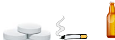
Drugs, smoking and alcohol