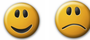
Feelings and emotions