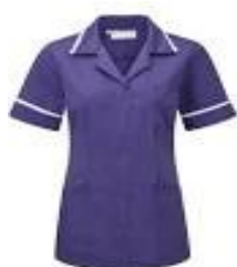
Lead Cancer Nurse