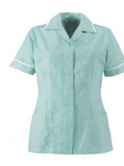
Care Support Worker

The Nurse in charge wears a red badge. If you have any questions or feedback, please speak to the nurse looking after you, the Nurse in Charge or the Unit Sister.