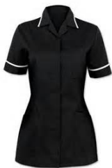
Clinical Nurse Specialist (CNS)