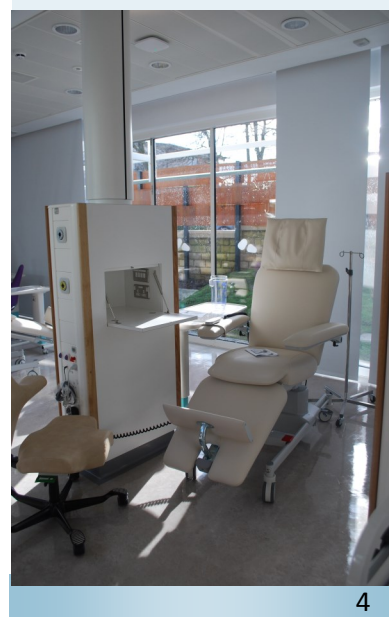
Image showing a treatment chair space in the SROMC Chemotherapy Suite

Free Wi-Fi is available for patients receiving treatment in the chemotherapy treatment area in pebble 2 only. Access is arranged through the nurses on the unit.