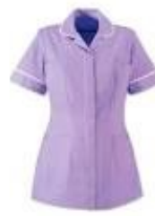
Clinical Care Support Worker