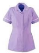
Clinical Support Care Worker