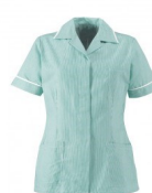
Care Support Worker